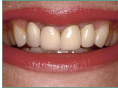
Metal can mean dark lines